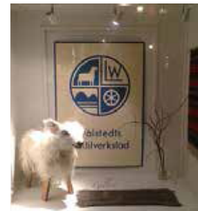
DISPLAY WINDOW WITH ROAD FRONTAGE (LIT 24/7)